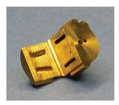
Figure 1 | Strong evidence. The 'strong' berylliumcopper cell used by West et al. <sup>5</sup> to demonstrate that supersolidity exists in solid helium-4, but not in solid helium-3. The cell has been cut to show the free annular space inside, which is filled with helium at low temperature and high pressure. The diameter of this annular space is 1 cm.

Naively, one would think that, if solid helium-4 flows without friction, the elastic shear modulus, \mu , of this solid should decrease, as it would resemble a liquid in some sense. But in 2007, James Day and John Beamish found the opposite4: at the temperature where the rotational anomalies are observed, \mu increases by a large amount, about 10%, as one would expect if the atoms were less mobile. Moreover, both the temperature variation of \mu and its dependence on the amount of helium-3 impurity seemed to be very similar to that of the rotational inertia. The results showed that there had to be a correlation between stiffening and mass flow. To understand this connection,